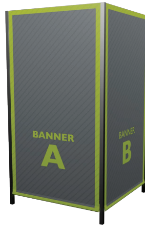
Perspective View 1